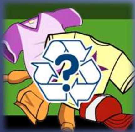
Estimated MSW Generation in New York State